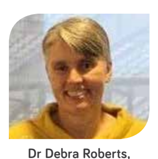
Co-Chair, Working Group II (Impacts, Adaptation and Vulnerability), IPCC